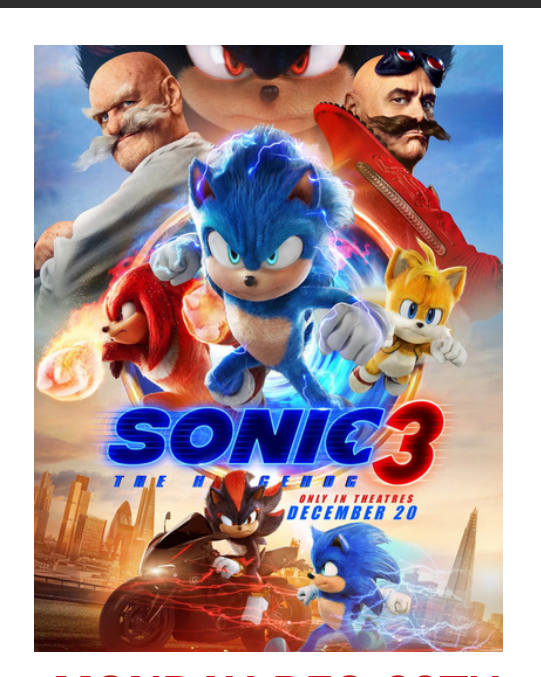
MONDAY, DEC. 30TH SESSION 2 @ 6:00PM THURSDAY, JAN. 2ND SESSION 3 @1:00 PM