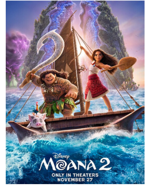
MONDAY, DEC. 30TH SESSION 1 @ 1:00PM

Join us for Sensory Movie Night @ Icon Cinema! This event is FREE to Caregivers of children/young adults with special needs and/or disabilities, as well as their immeditate Family.